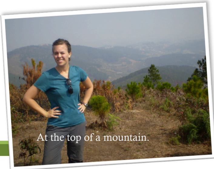
At the top of a mountain.

My team is also trying to be intentional about meeting people and building relationships. We're slowly forming some friendships though. One friend the girls met is an older lady who talked to us as she walked for exercise. Another waited on us at a coffee shop. My team is also building stronger relationships with friends that staff have established. Thank Him! I am so excited to have friends here and connect with