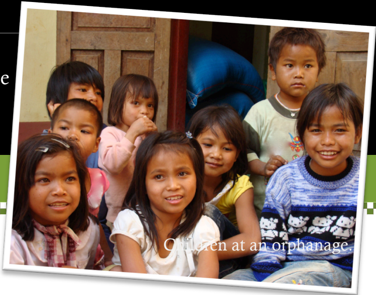
Children at an orphanage

“Go out...and compel them to come in, that my house may be filled.”