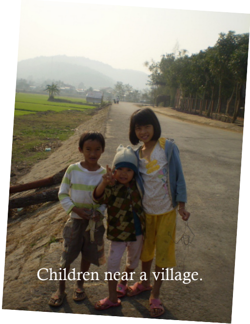
Children near a village.

Some of these tribal groups have been influenced by Pr0testant groups and some by C@tholicism. However, 3 of the tribes are considered “unre@ched,” meaning that 2% or less are prOfessing family members. They don’t have the